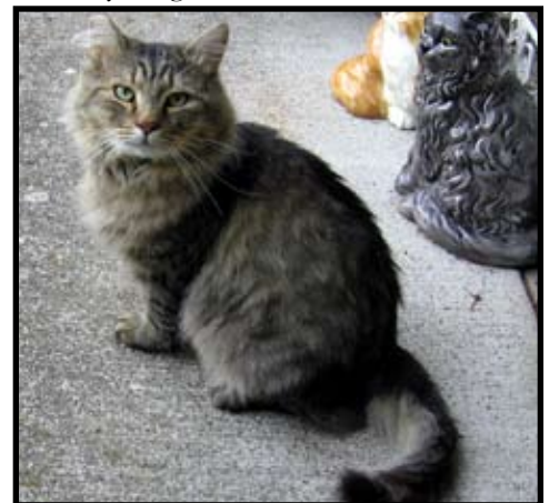
"Little Kitty," a big success!

About a year and a half ago I saw a very pathetic little cat slinking around our cul-de-sac. We were all alarmed to see how bad he looked. His eyes were crusty, he had a cough, his hair was falling out in clumps, and he was quite small. No one could get near him since he was terrified of everything.