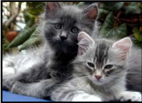
Unwanted kittens fill shelters and stress their services

With the term “coalition” in our name, it makes sense that we work with many groups to help feral cats. Over the years we have collaborated with humane societies, cat rescue groups, city councils, and most recently we have partnered with the Animal Shelter Alliance of Portland (ASAP) and the Audubon Society of Portland.