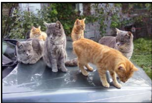
Chapman ferals on the car hood

Watch your mail in late August for your "invitation" to this non -event, where you do nothing but support feral cats!