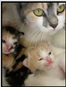
Kitten Season has begun

I write this on the ides of March, having spent last Friday morning spaying cats at an FCCO clinic and seeing firsthand that the feral feline community is already doing what intact cats do in spring – reproduce. This time of year is called Kitten Season! Have you heard this term and wondered what it is or why it occurs every year? To explain, we need a brief cat biology lesson.