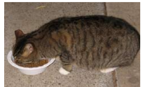
Tiny Vinny, with an ear tip, eating inside now.